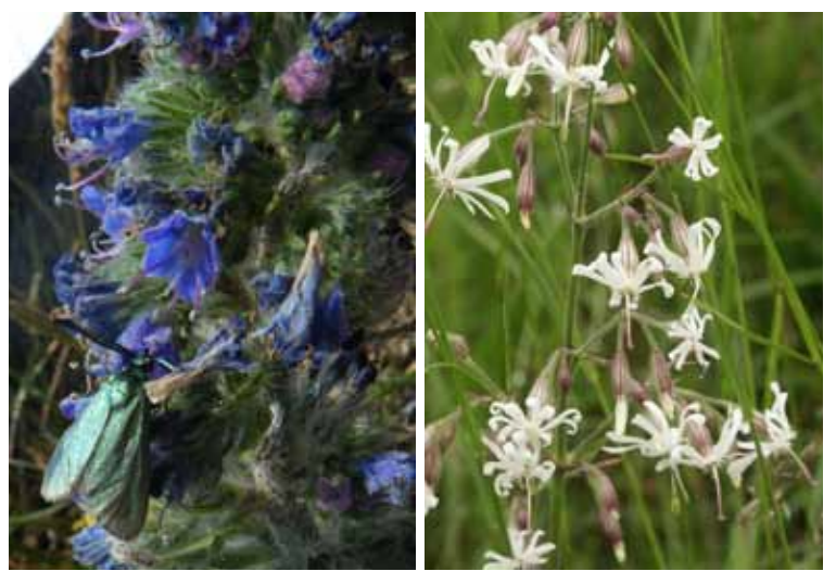
Foresters Moth on vipers bugloss

It's chequered past of kings, castles and exotic species has had a lasting impact on this landscape that peers out to sea. Maintaining these tiny fragments of limestone grassland is crucial to the survival of these often-overlooked but beautiful rarities.